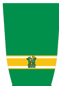
SUBLIMATED SOCKS WITH LOGO (22") $20.00 (28") $22.00 (26") $20.00 (30") $22.00