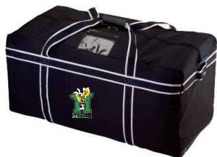
30" JR HOCKEY BAG $79.00 40" SR HOCKEY BAG $90.00