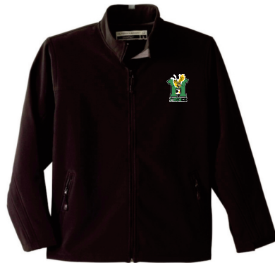
SOFT SHELL JACKET (ADULT) $97.00 (YOUTH) $97.00