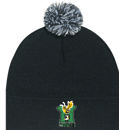
POM POM TOQUE (ONE SIZE) $15.00