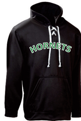
PERFORMANCE DANGLER HOODIE (ADULT) $85.00