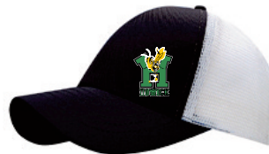
COTTON MESH TRUCKER CAP (ONE SIZE) $15.00