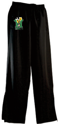
TWILL WARM UP PANT (ADULT) $52.00 (YOUTH) $49.00