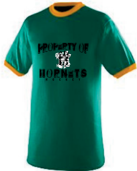
RINGER TEE (ADULT) $17.00 (YOUTH) $16.00