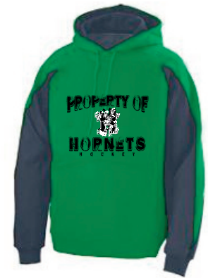
VOLT HOODIE (ADULT) $40.00 (YOUTH) $39.00