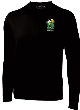
WICKING TEE LONG SLEEVE (ADULT) $18.00 (YOUTH) $18.00