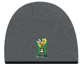
BEANIE BOARD TOQUE (ONE SIZE) $16.00