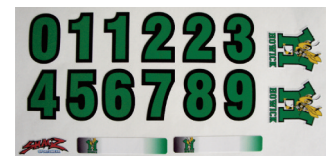
PLAYER STICKER PACKAGE (SHEET) $9.00